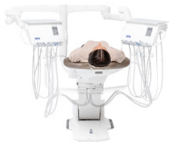
From right to left in 10 seconds

Planmeca Compact i3 can be switched from right- to left-hand use in just 10 seconds simply by moving the instrument console – without having to move the operating light. This makes it a practical solution for all clinics where several dentists use the same dental unit and space is limited.